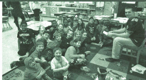
NP Knights football players read to elementary students to emphasize the importance of reading through the Annual Reading Super Bowl.