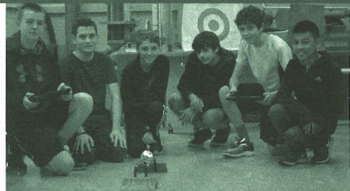
Ninth graders learn to problem solve as they program their Sphero, a robotic ball that is controlled with a tilt, touch or swing of a smart-phone or tablet.