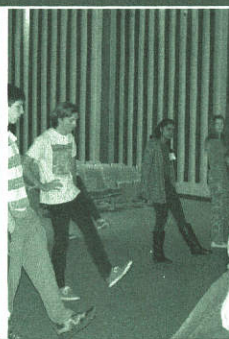
Will Power actors from DeSales University perform a truncated show of Hamlet. Students practice techniques and discuss the texture of the play, complexity of characters, their motives and relationships, and staging of a Shakespearean tragedy.

Many families wish to show their appreciation to a special teacher, principal or support person who makes a difference in their child's life by offering a small gift during the holiday season. While our staff greatly appreciates these genuine gestures of thanks, please consider giving a gift that keeps giving long after the holidays are over - a donation to the NPSD Educational Foundation.